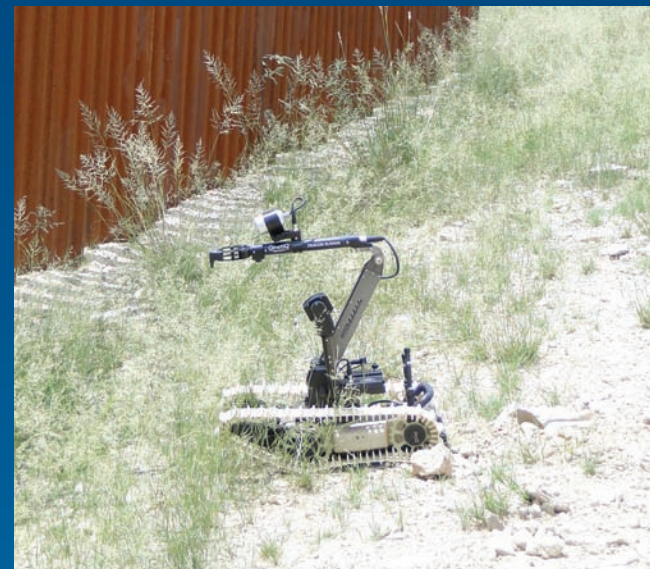
Dragon Runner 20

They are simply the best small robots in the world.