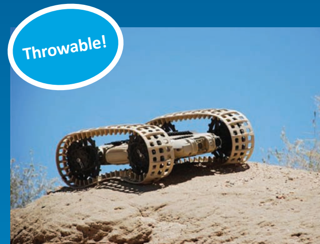
Dragon Runner 10